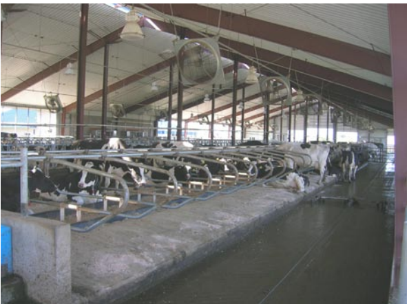
Free Stall Housing