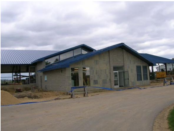
Front during Construction