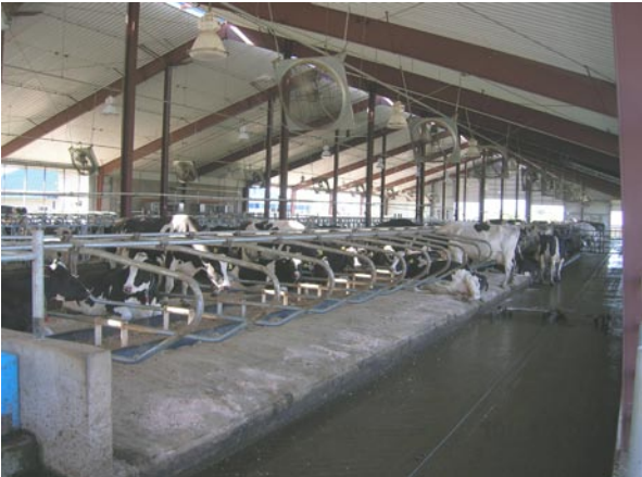
Free Stall Housing