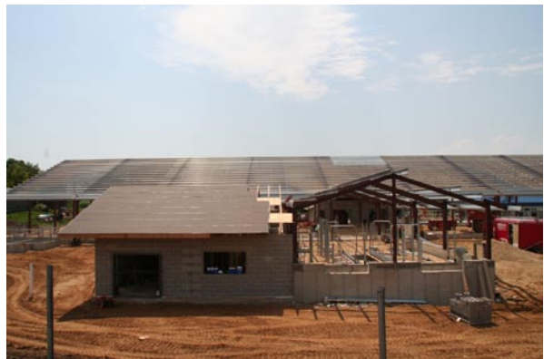
Parlor under Construction