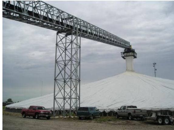
1.5 million bushel outside storage