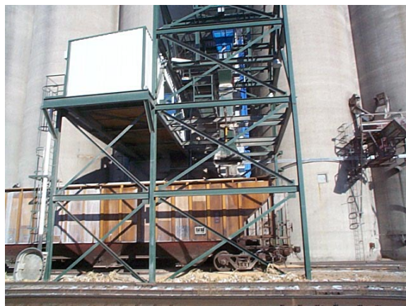
New Rail Load Out