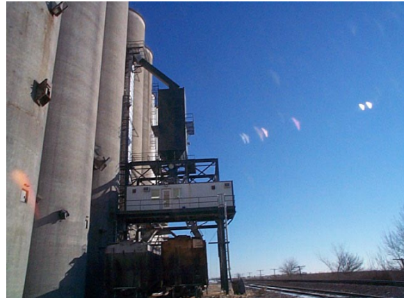
New Rail Load Out