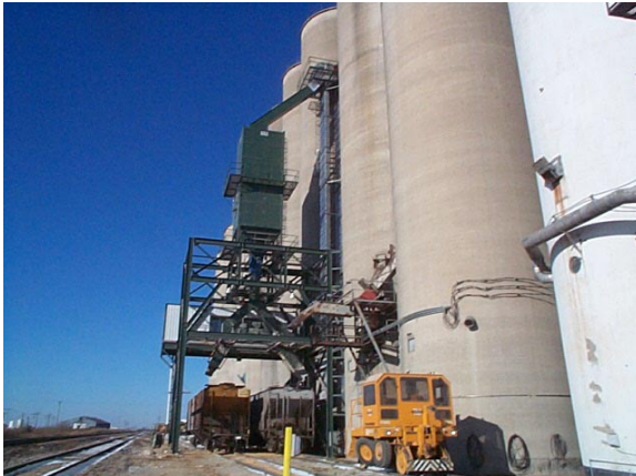
New Rail Load Out