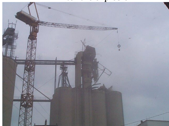
The south wall removed