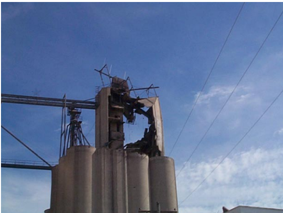
After the explosion