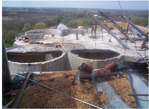
Removing the debris