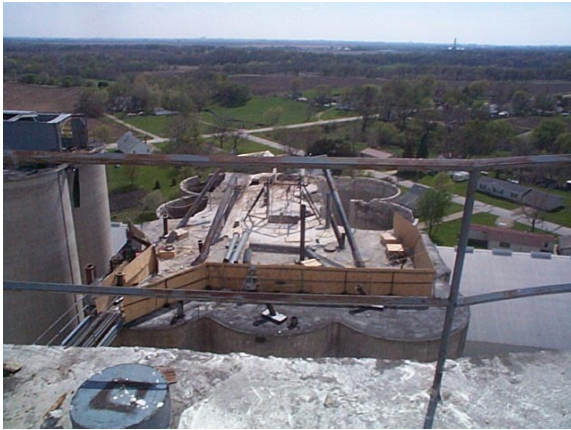
Removing the debris