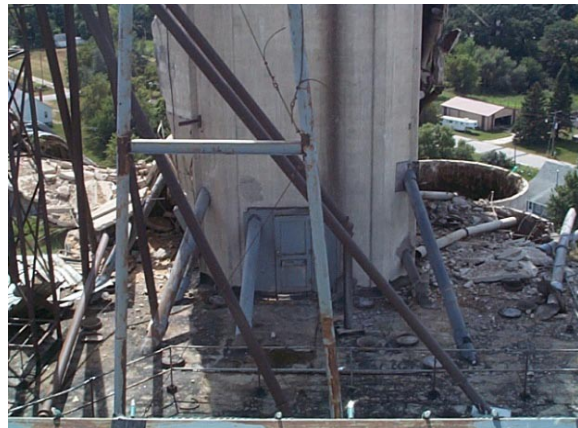
After the explosion