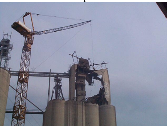
Removing the south concrete wall